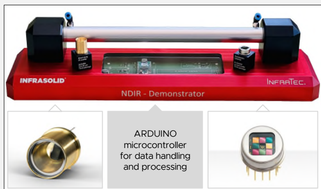
Fig. 2: NDIR-Demonstrator with HISpower series IR emitter and pyroelectric 8-channel-detector – supported by InfraTec GmbH.